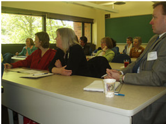
Break out session at the Spring Conference