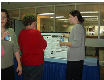
Conference goes at the poster session