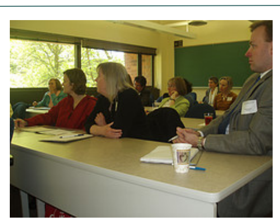
Break out session at the Spring Conference